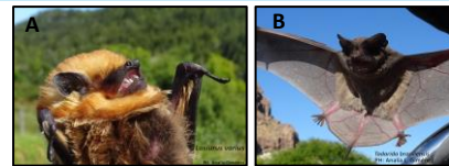
Figure 2: A: Lasiurus varius , B: Tadarida brasiliensis .